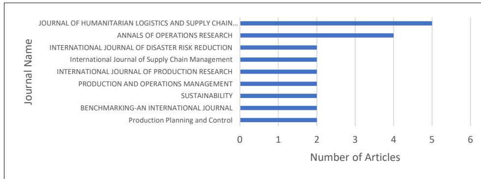
Figure 3. Number of papers by journal (included if (n > 2) )

papers), Thailand, South Korea, Korea, and Malaysia (2 papers), among other prominent nations. The remaining ones have each contributed one publication.