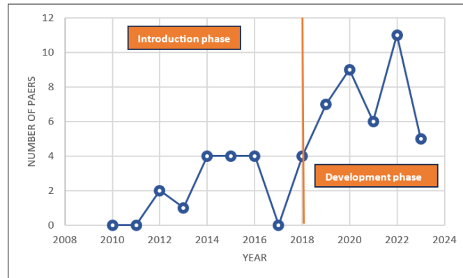
Figure 2. Annual Number of papers.

The number of papers collected was 50 between 2010 and 2023. We haven't found any publications in three years as appears in Fig. 2.