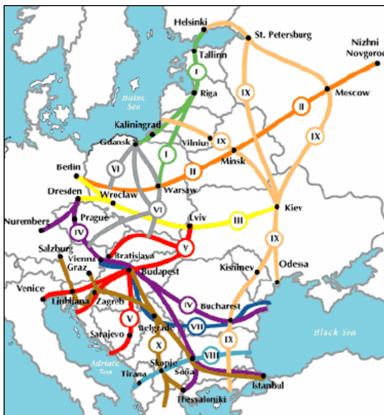
Fig. 2. Map of transport corridors in Central and Eastern Europe

Transportation system of Middle and Eastern part of Europe join Helsinki with Thessaloniki and Berlin with Moscow. Well developed transportation system helps to broaden services in logistics centers, especially in Poland, Hungary and Slovakia.