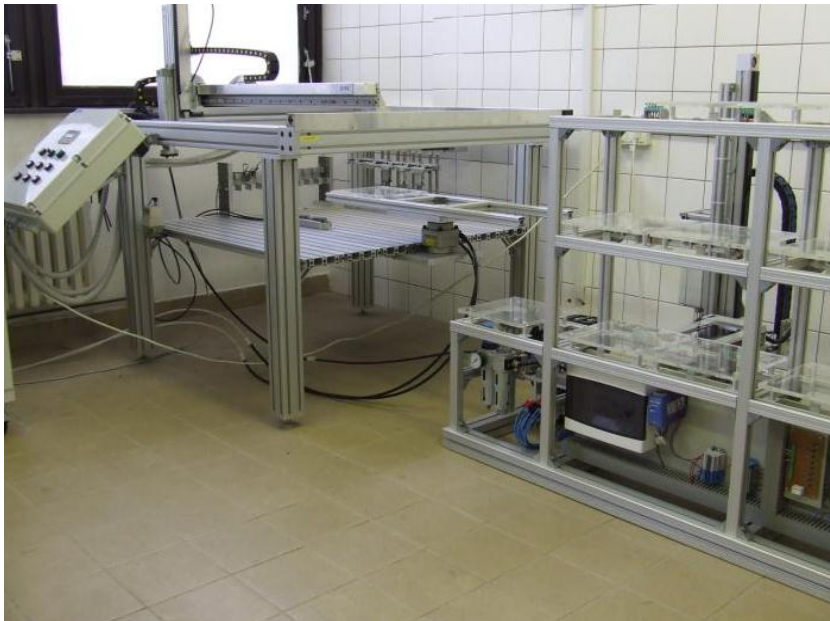
Figure 1. Intelligent assembly cell in the IPSAM

The several papers have been devoted to this area – Intelligent assembly cell. There are in more detail described its principles – [5.], [6.], [7.].